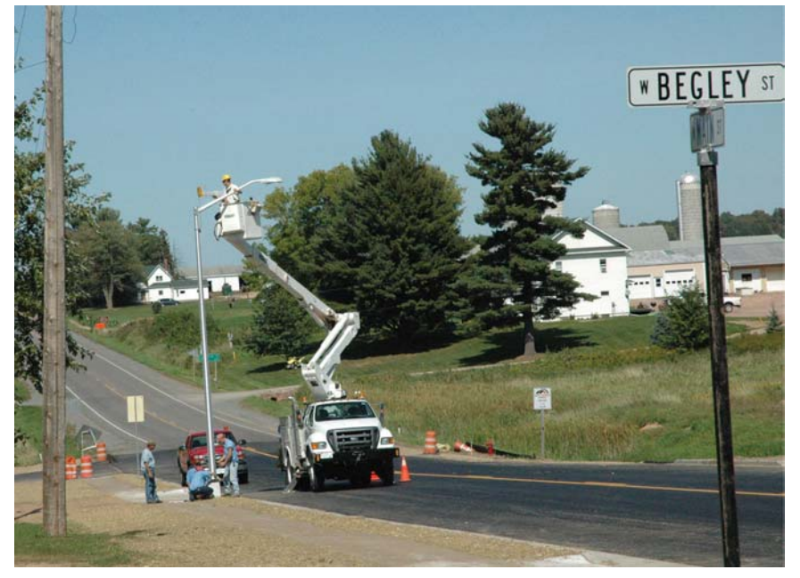
Clark Electric crews help the City of Greenwood install the final street lights on the north side of town.

Now that the inconvenience is over, come on over to our offices to say hi, stop by the Appliance & Satellite store to check out the great deals on GE appliances, or get DirecTV for those long cold winter months.